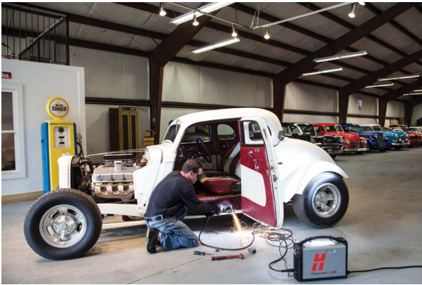
Vehicle repair and modification